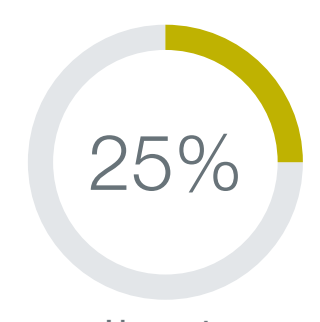
Licence to Operate For example minimising community actions / protests