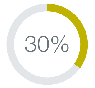
Reduction in Liabilities For example health and safety claims, contamination

Respondents tell us that value protection has come from: