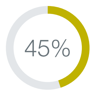
Proactive Risk Mitigation For example reduce absenteeism and disruption costs